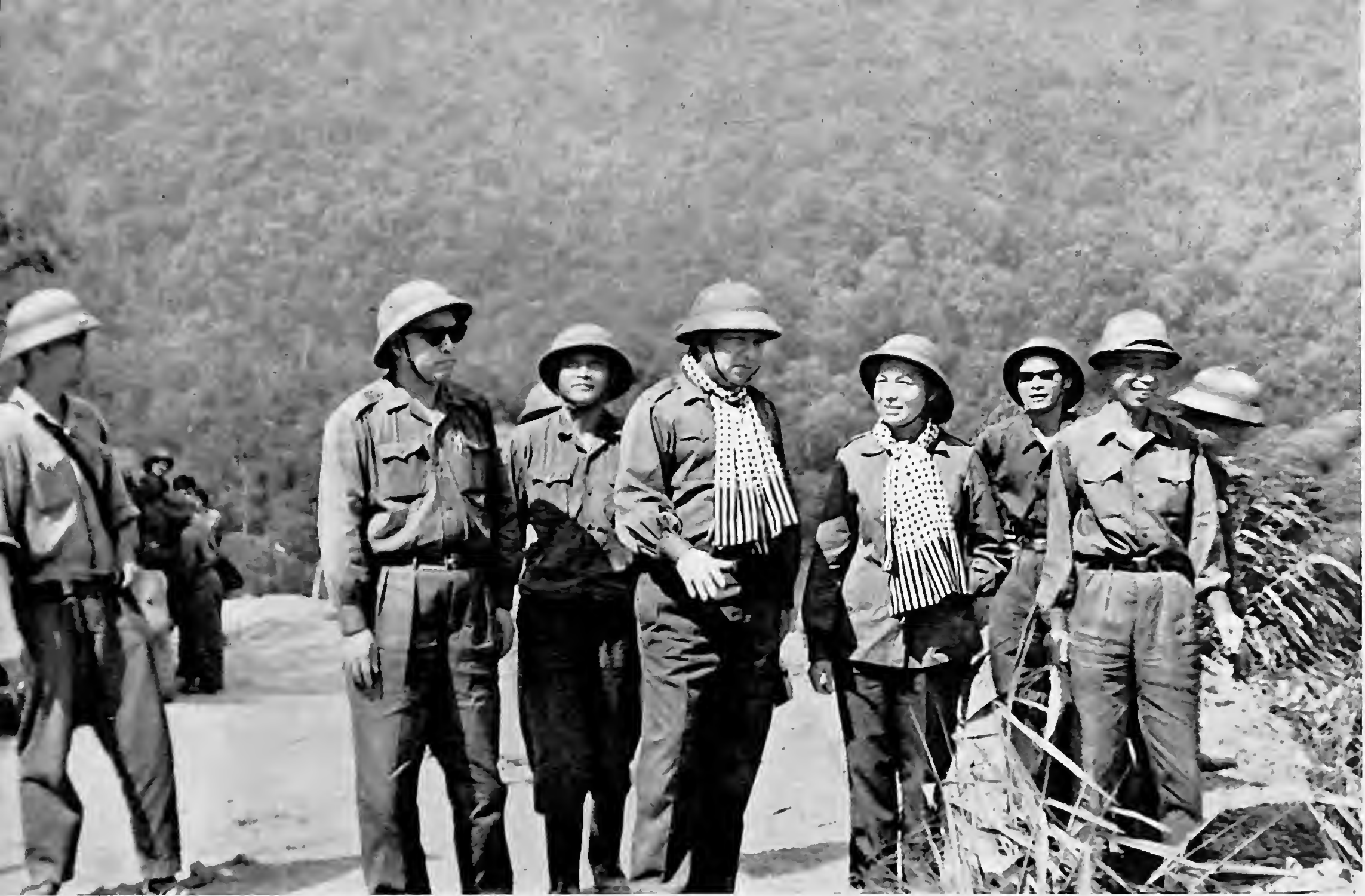
Somewhere in the Truong Son Range.